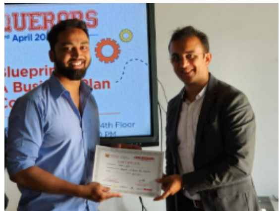
BUSINESS PLAN COMPETITION WINNERS