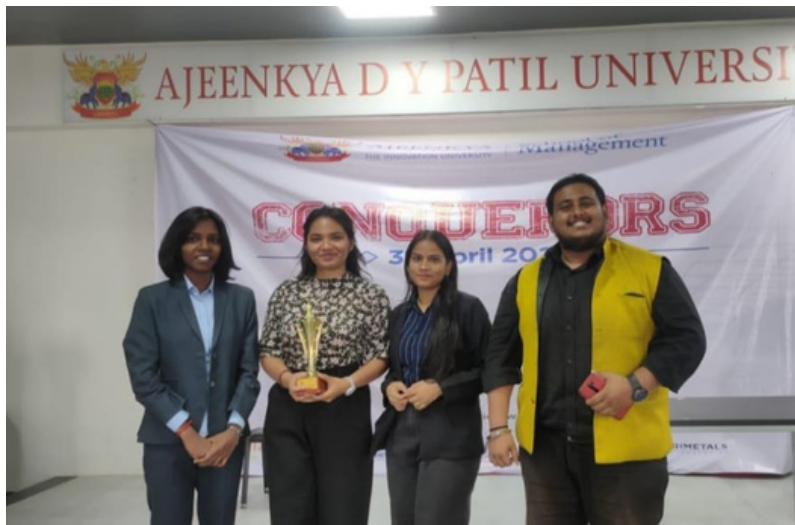
MAD ADS WINNERS

"Make atleast one definite move daily towards your goals" -Bruce Lee