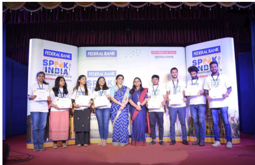
SPEAK FOR INDIA